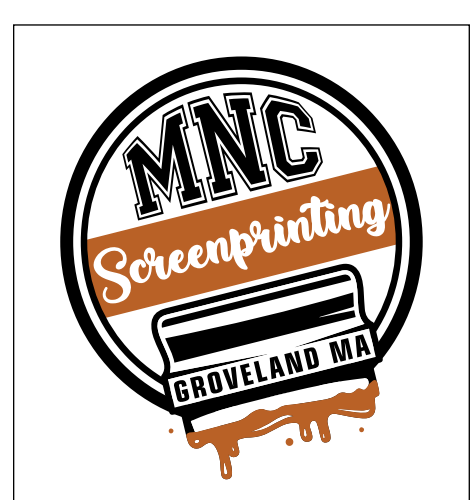
Screen Printing & Embroidery Print & Digital Design Web Design & Maintenance

"The beauty of Plum Island and this whole area never gets old... as many times as I walk the beaches and marshes, it always seems brand new and brings me much joy!"