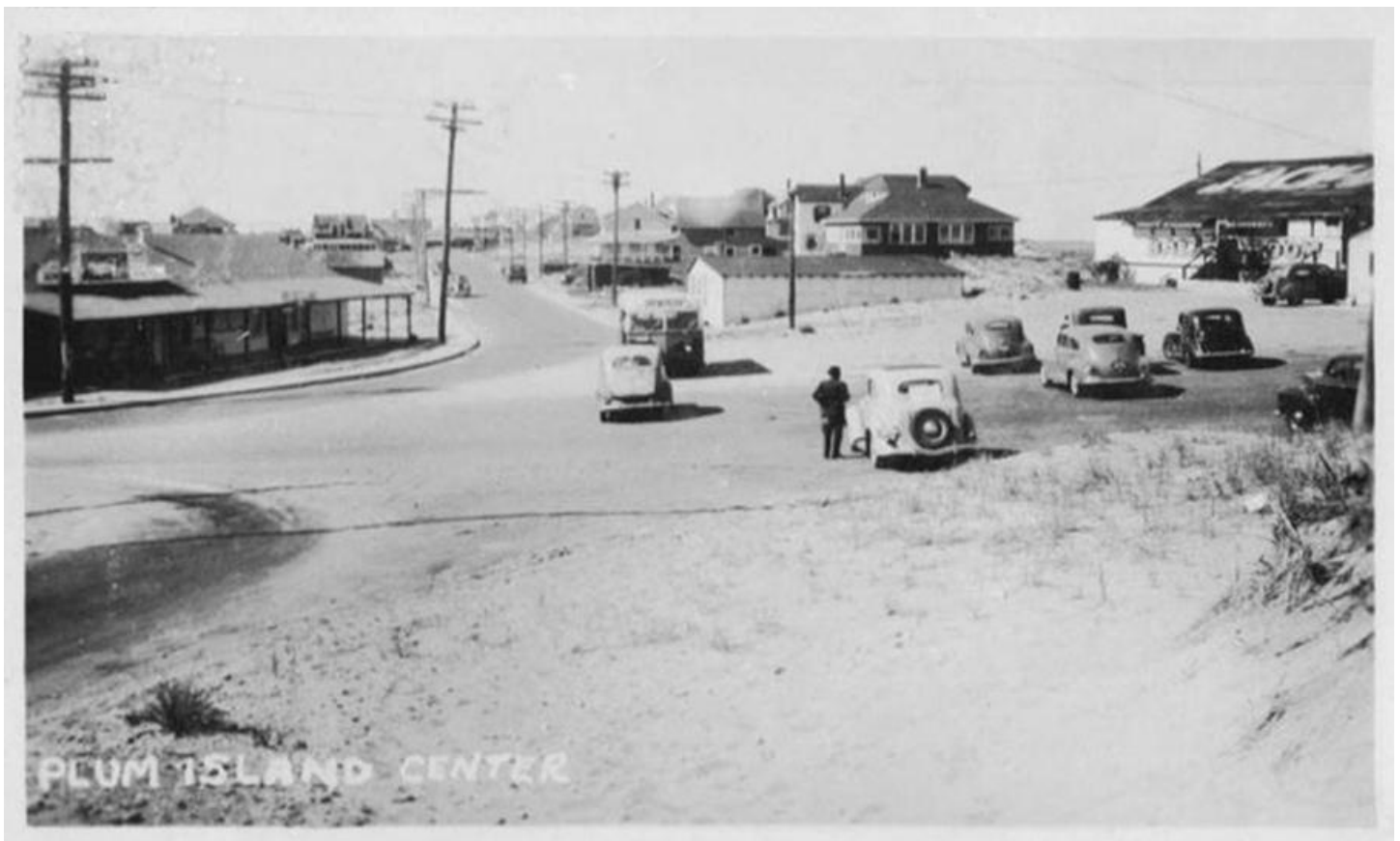
Plum Island Center, 1938

8 PLUM ISLAND BOULEVARD, NEWBURY, MASSACHUSETTS 01951