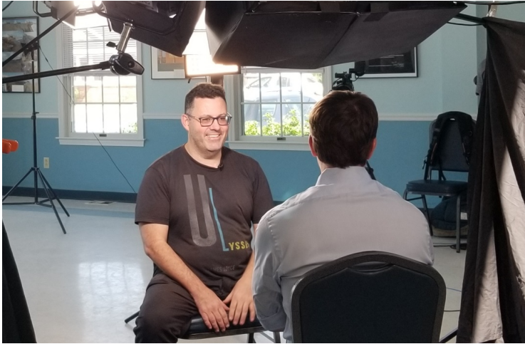
Adrian McKinty

correspondent Jeff Glor about his latest novel "The Chain," which is set in Newburyport and on Plum Island.